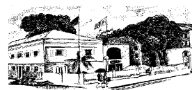
The Florence Williams Public Library

Support The FRIENDS OF THE LIBRARY Organized by: The Virgin Islands Pace Runners Sanctioned by: The Virgin Islands Track and Field Federation