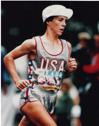
Tribute to Joan Benoit-Samuelsn

When Joan Benoit entered the tunnel of the Los Angeles Coliseum as the leader of the women's Olympic Marathon on August 5, 1984, she was to become the first female to win the Olympic Gold medal in the event, her time was 2:24.52.